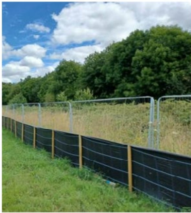
Figure 3: Permanent Style Reptile Fencing